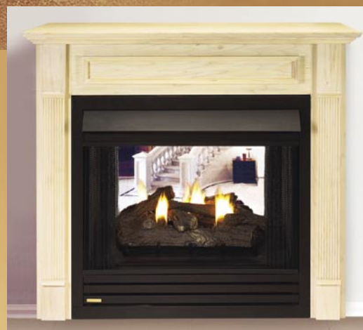
VFST-2 shown with See-Through surround finished in a clear stain