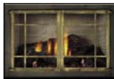
SQUARE PANE DESIGN