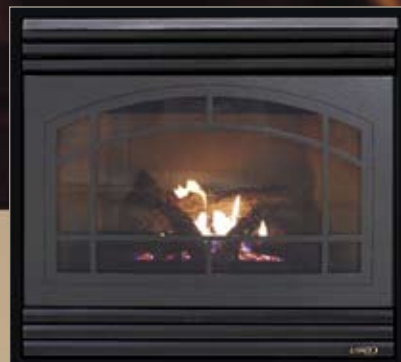
MPB3328 shown with optional textured iron decorative arch screen panel kit

HEARTH PRODUCTS Innovation never felt so good.™