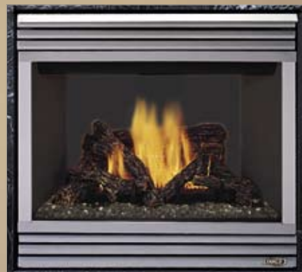
MPB3530 shown with brushed stainless louvered doors, hood and door trim