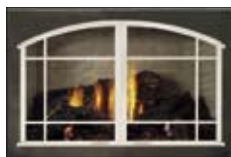
ARCH PANE DESIGN