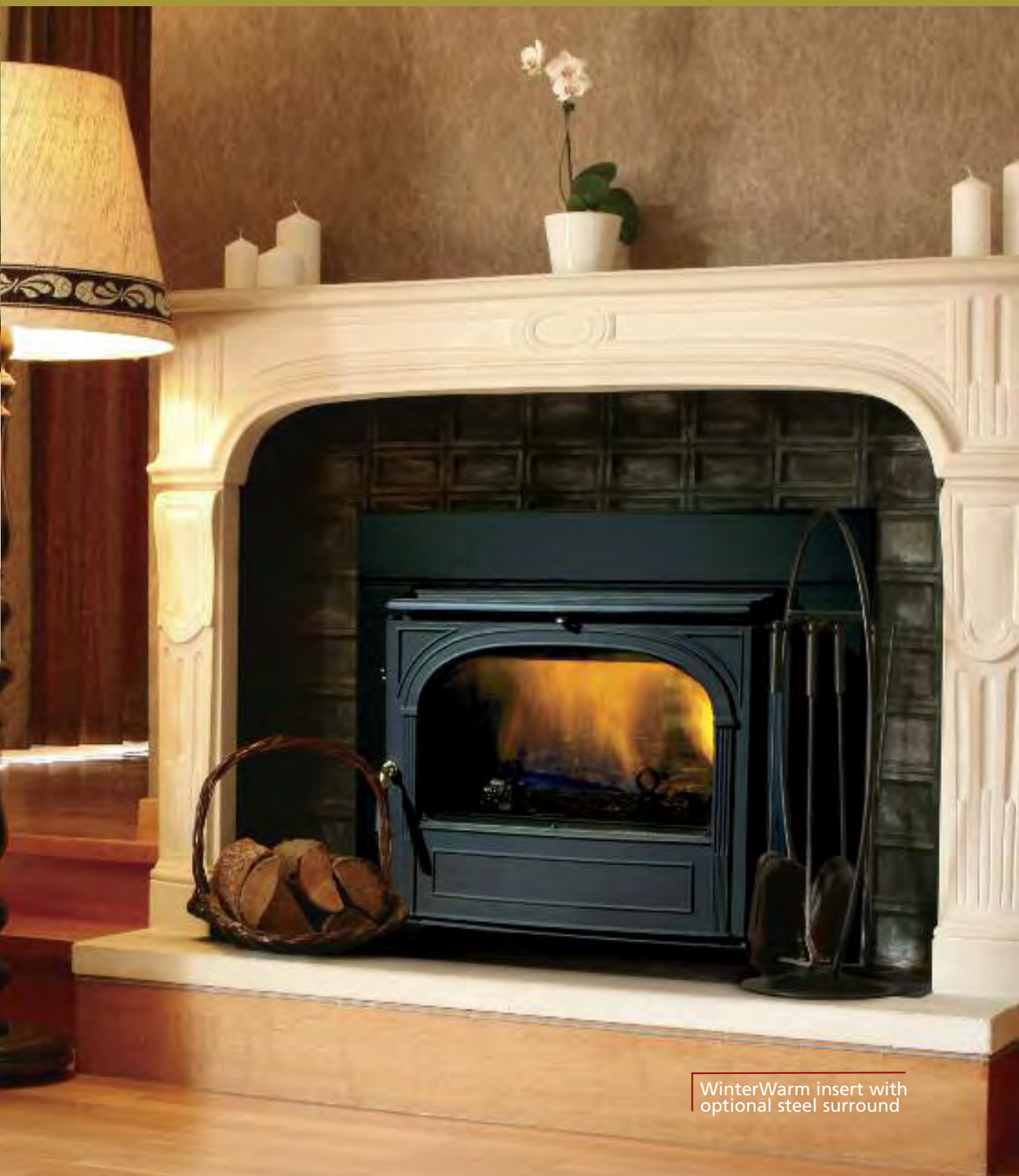
WinterWarm insert with optional steel surround

The WinterWarm small fireplace Insert slips easily into your existing fireplace to instantly transform it into an efficient heat source. You'll enjoy all of the beauty of an open fireplace, with all of the convenience and performance of a state-of-the-art wood stove. Go state-of-the-art warm with WinterWarm.