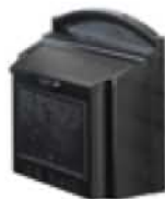
Black Item #16022