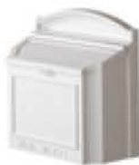
White Item #16013