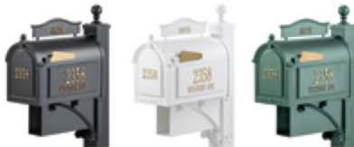
Black Item #16305