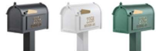
Black Item #16311