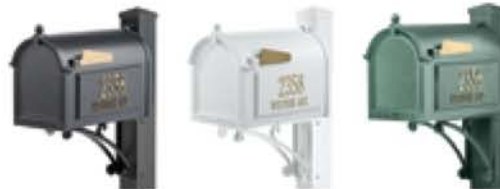
Black Item #16308