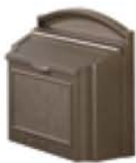
French Bronze Item # 16012